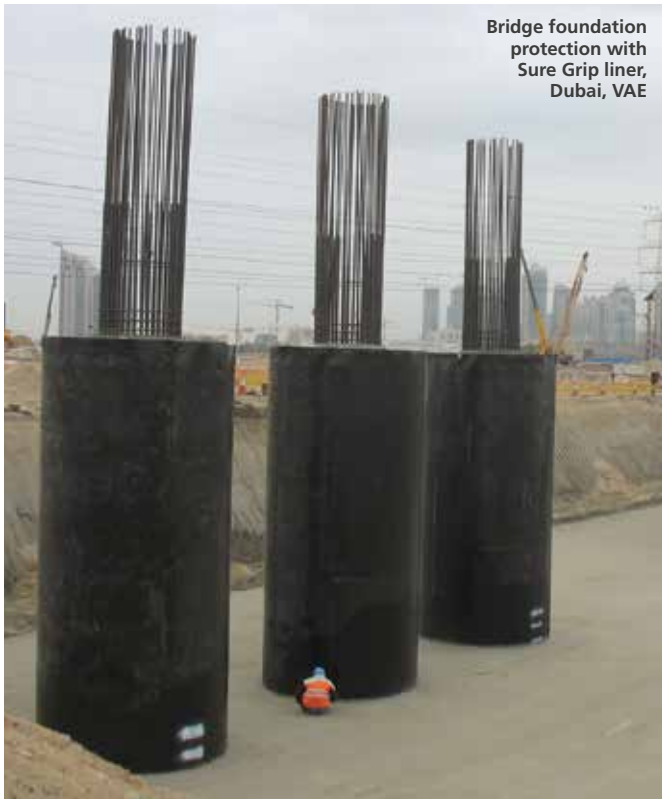
Bridge foundation protection with Sure Grip liner, Dubai, VAE