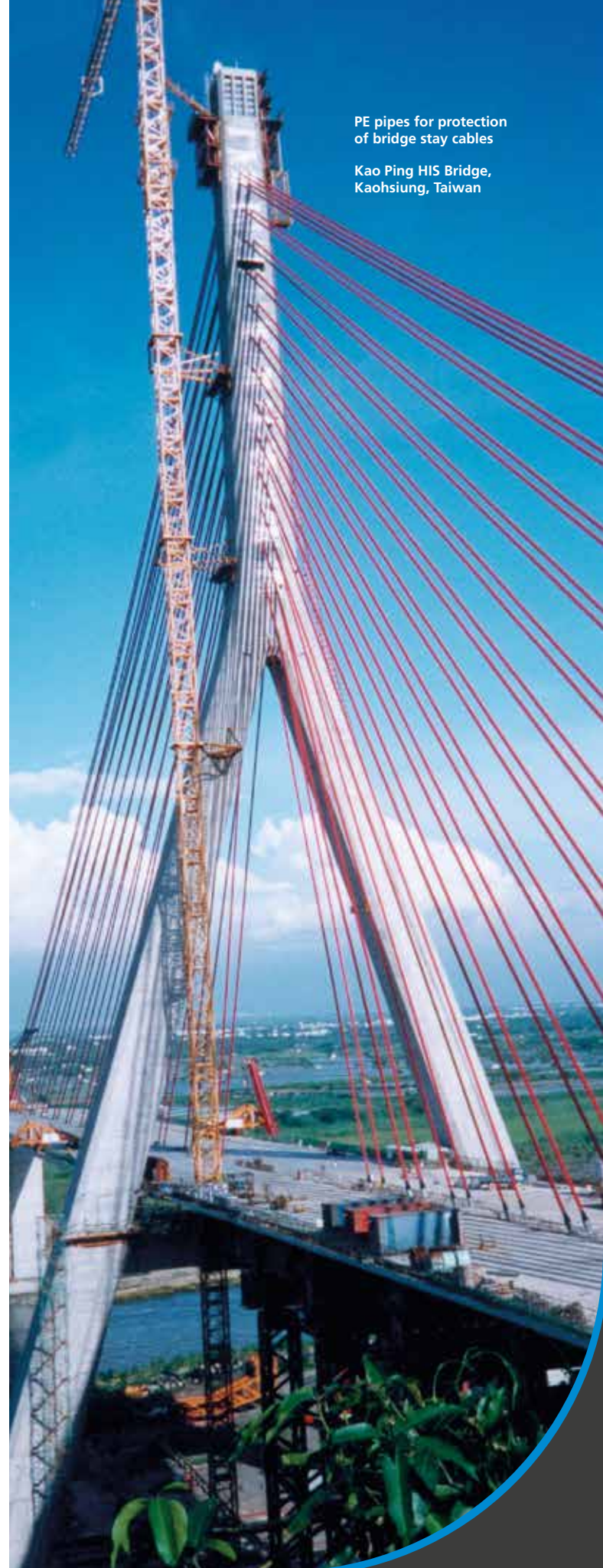
PE pipes for protection of bridge stay cables