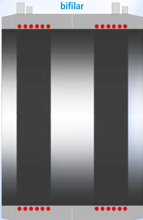
Large EF-coupler bifilar