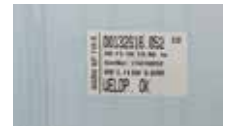
SP 110-S V3