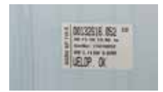
SP 110-S V3